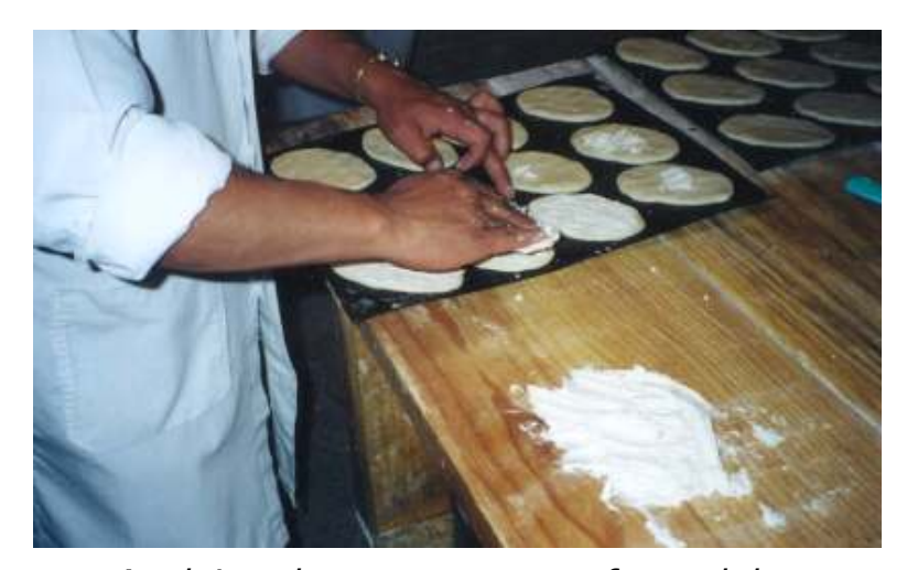
Applying the pasta on top of pan dulce.

I now combine the same ingredients for pan dulce minus the manteca, shape the dough and put it all on separate ojas (metal baking sheets).